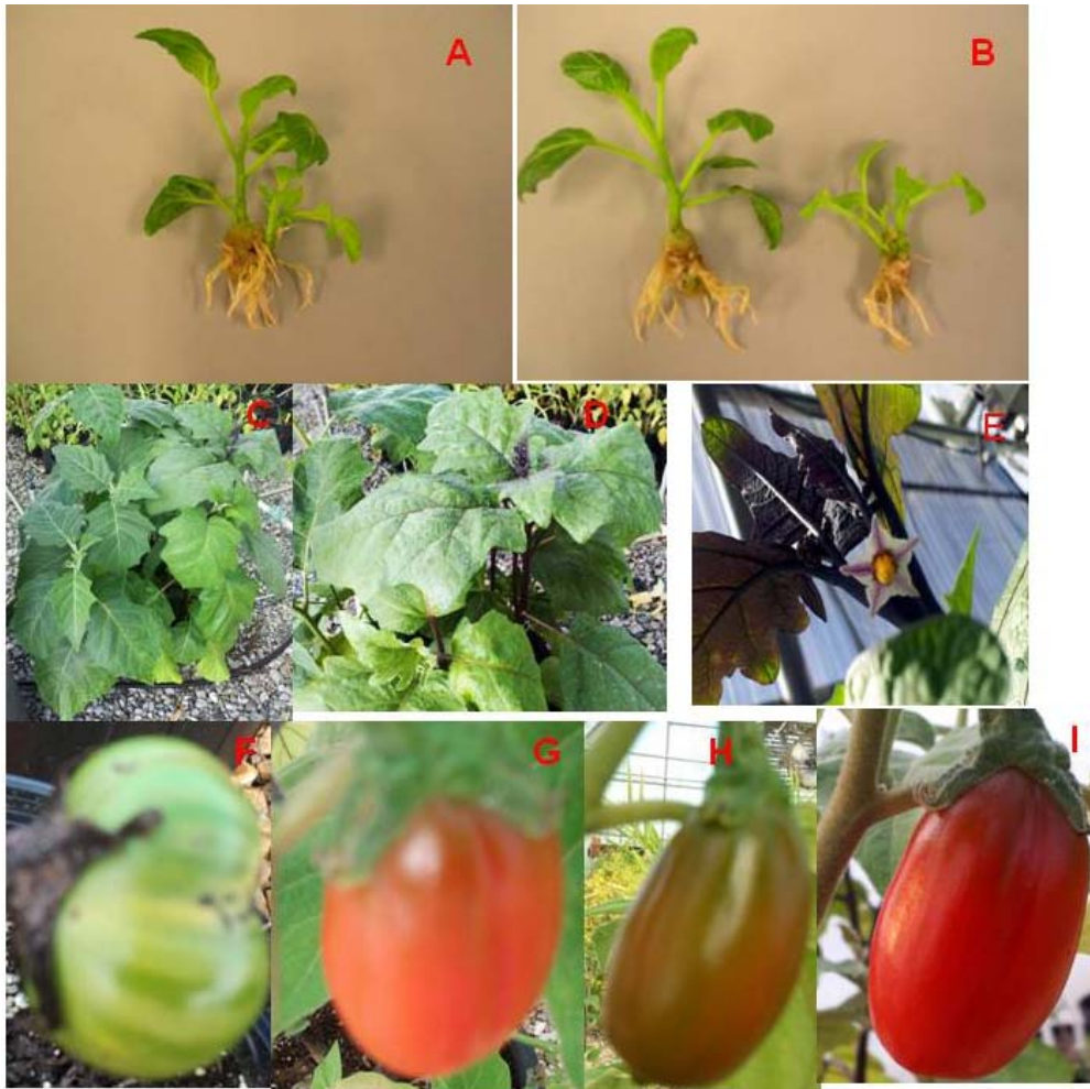
Fig. 1. A–B: Solanum aethiopicum meristems cultured on M1 or M2 media typically produced plantlets with well developed root systems. Multiple shoot production from a single meristem was not uncommon for both media. C–I: S. aethiopicum genotypes are known for the diversity found in the color and shape of their leaves, stems, and fruits.